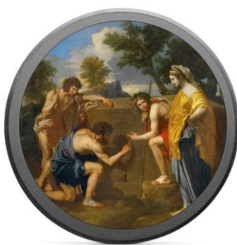
Round (Closed Frame)