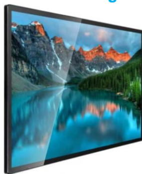
Digital Signage (Closed Frame)